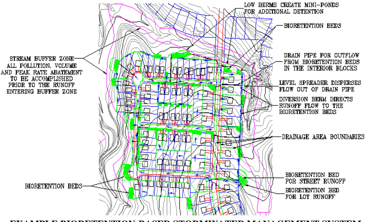
EXAMPLE BIORETENTION-BASED STORMWATER MANAGEMENT SYSTEM FIGURE 3

As noted, bioretention is a highly versatile concept. To illustrate that bioretention could be integrated into the landscaping scheme in any number of ways, consider these variations of this method listed in "The Bioretention Manual" published by Prince George's County: